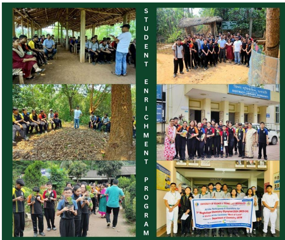
STUDENT ENRICHMENT PROGRAM

The school relentlessly strived to adopt innovative and learner-centric pedagogies to engage, inspire and enrich the student community. These approaches were thoughtfully designed to provide additional educational opportunities and meaningful experiences beyond the confines of the standard curriculum, with the goal of enhancing both academic learning and personal development. Emphasis was laid on fostering 21st-century skills such as critical thinking, creativity, collaboration, communication, and digital literacy. In addition, life skills like emotional intelligence, problem-solving, leadership, and adaptability were seamlessly integrated into the learning process. Through project-based learning, interdisciplinary activities, experiential workshops, and value-based education, the school created a holistic learning environment.